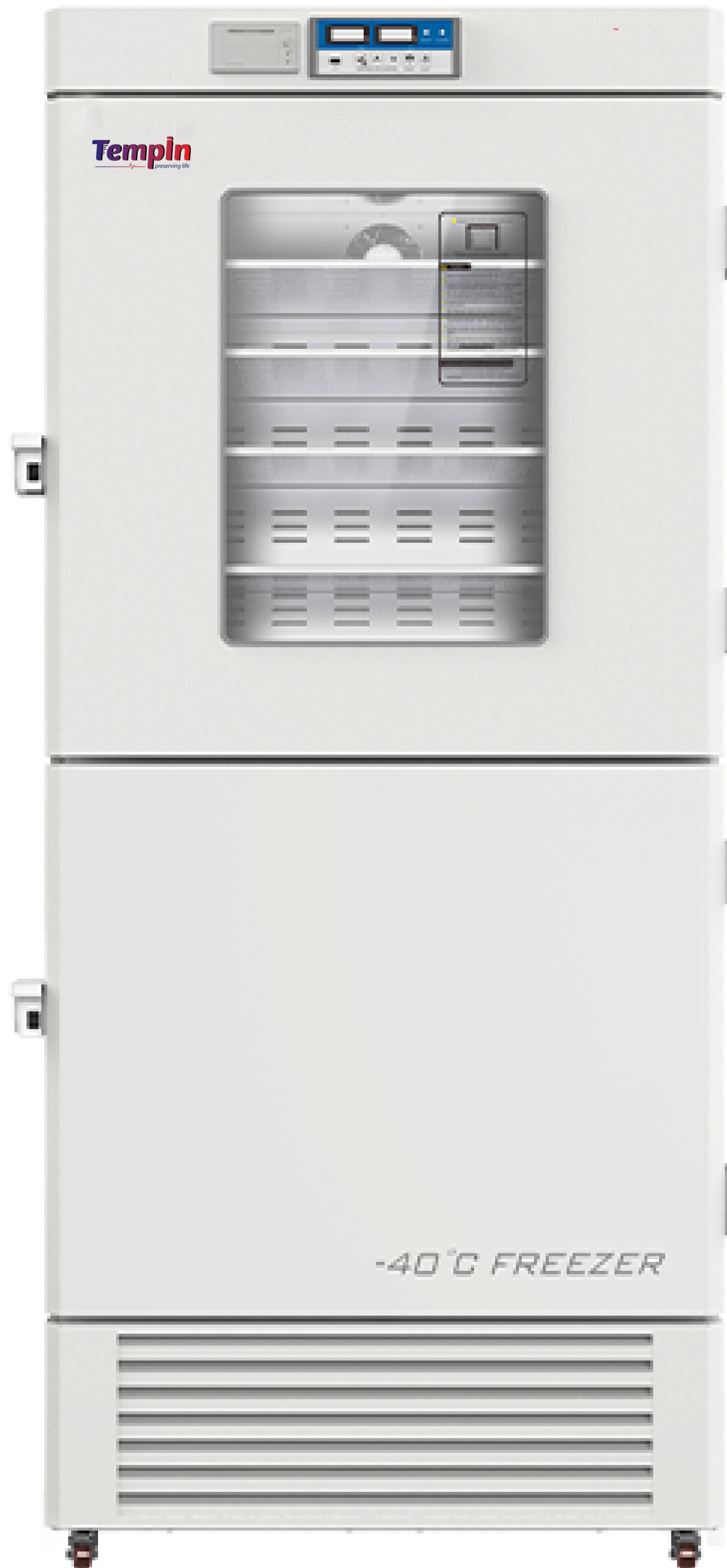
2°C~8°C/-10°C~-40°C Medical Comibined Refrigerator And Freezer TI-FL-519