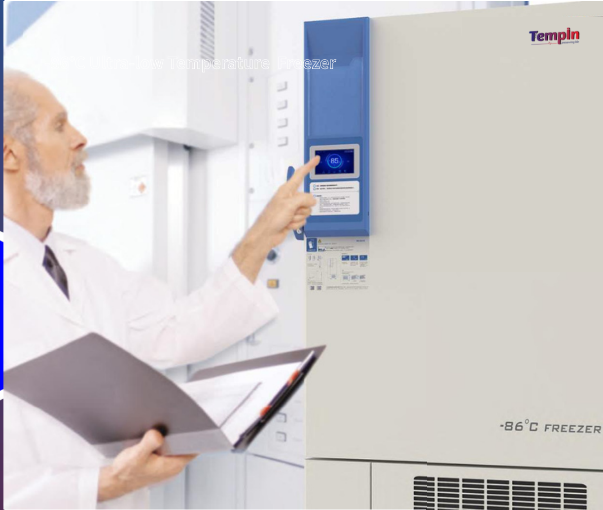
-86°C Ultra-low Temperature Freezer